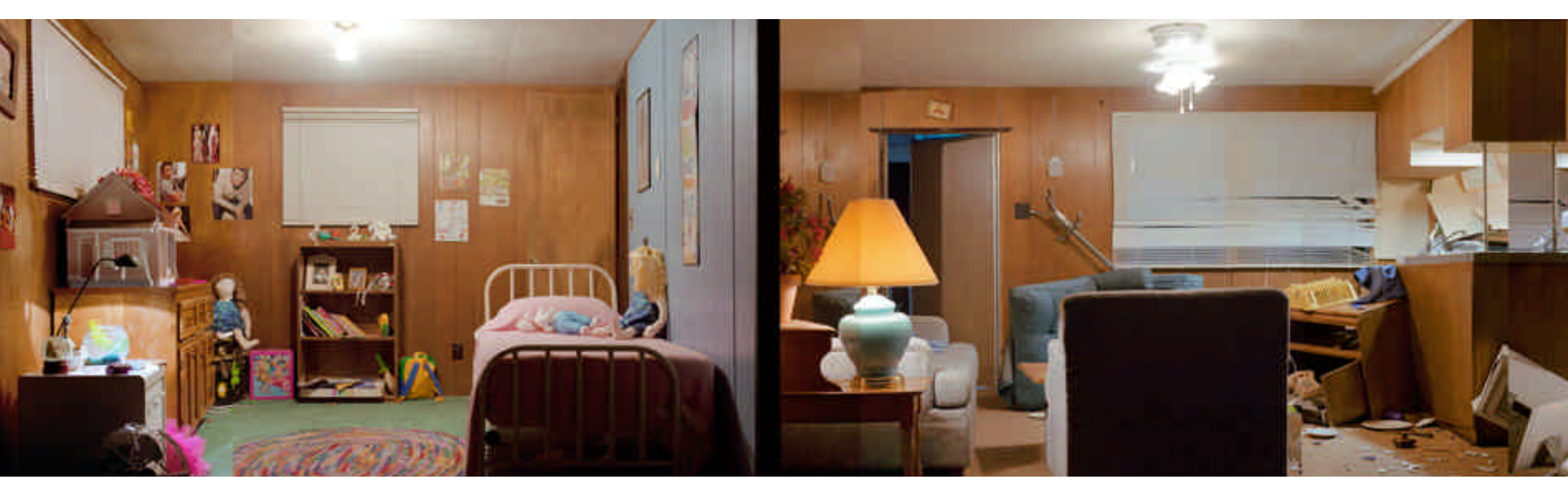
Set for Single Wide, 2002. C-print, 18.5 x 94.4 in. (46.9 x 239.7 cm).

The viewer's position as an individual subject is problematized by the lack of a singular viewpoint; while a strategy used in conventional film narrative, the artists deliberately call attention to the multiple narrative perspectives of Single Wide , rather than attempting to mask the transitions and create a seamless experience. As each loop further denies cause and effect, it undermines the logic of the narrative, and enhances its impossibility, its artificiality. As in Hubbard and Birchler's photographic and video works overall, Single Wide ultimately is posited against the creeping fictionalization of the world, wherein arguably our entire framework of viewing and interpreting current existence has been funneled through the entertainment medium. A broad body of media theory has articulated the extreme extension of this idea to a near post-human state in which all aspects of engagement are artificially constructed—drawn from cinema to be sure, but applied far beyond, to politics, social relationships, and economic desire.