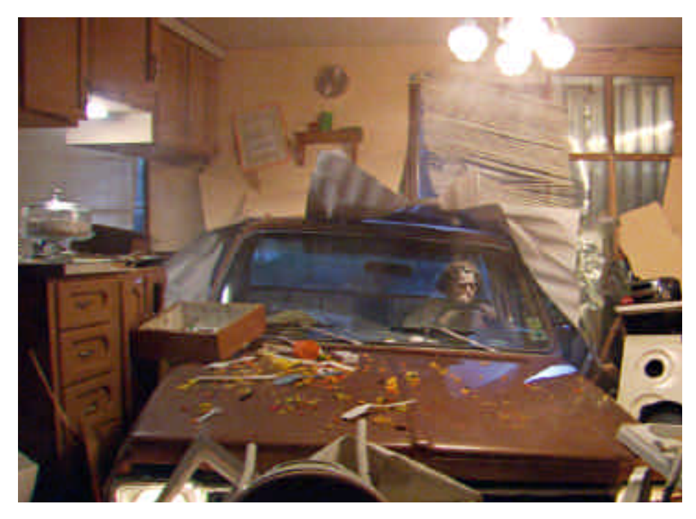
Still from Single Wide , 2002. High-definition video, color, sound; 6:10 min.

toppled on its side, a strangely intimate violation. A pair of jeans hangs from the folding chair that suffices at the vanity, pulled back as if someone has just stood up. You are so relieved when the phone stops ringing and you hear the truck engine outside. Are you moving faster or much, much more slowly? Now it's hard to tell. The headlights glint off of an aluminum trashcan outside. The woman cries, hands on her face and, in the interior light of the truck's cab, you clearly see the recent angry cut over her left eye. As you keep moving, seemingly forward, time unravels. It is after the crash but before it again. The cut is because of the crash or what precipitates it. Is it her violence or someone else's that you see? The tension between silence and sound increases each time you walk around the house. With each pass by and through the windows, the phone that you know will ring each time becomes more jarring than the anguished sound of her voice as she pounds the steering wheel.